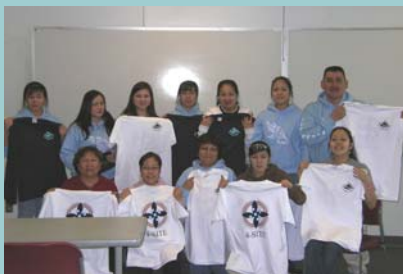
Napaskiak HS Girls Team

Loan Program – The next deadline to apply is October 31, 2006. If you have any questions about the loan program, please contact your local CVRF office or the Anchorage office at 1-888-795-5151.