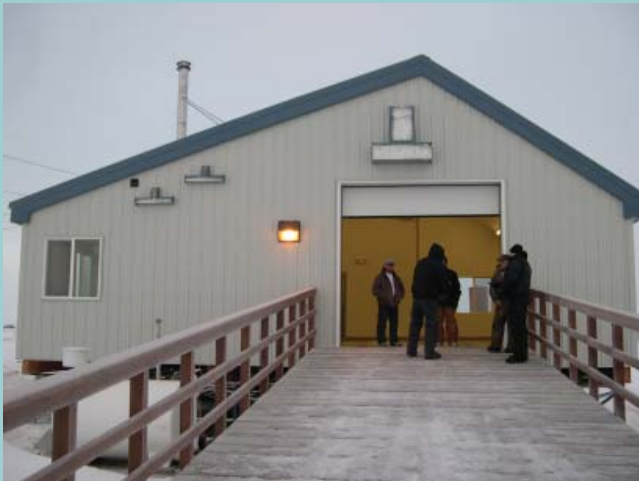
Completed Fisheries Support Center

Construction is finally around the corner for Phase I Fisheries Support Center projects in Hooper Bay, Kongiganak, Kwigillinok and Toksook Bay. Materials are being loaded in Seattle for arrival in Bethel on the first barge in late May.