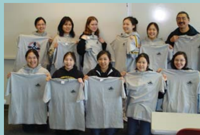
Scammon Bay HS Girls Team