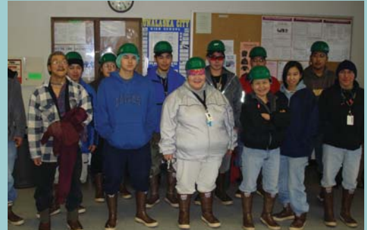
CVRF Residents at Westward Seafoods in Dutch Harbor

Youth Leadership - Youth groups had their regular meetings during the quarter and are preparing for various activities. If you are between the ages of 14 and 24, and are interested in participating in the Coastal Villages youth leadership program, please contact your local CVRF office or the Anchorage office.