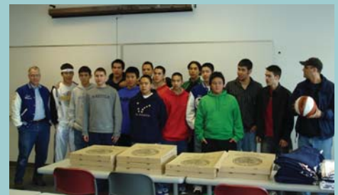
Kwigillingok HS Boys Team

Congratulations to the Napaskiak High School Girls Basketball Team, Scammon Bay High School Girls Basketball Team, and Kwigillingok High School Boys Basketball Team for making it to the 1A State Basketball Tournament in March! Your hard work and teamwork paid off!