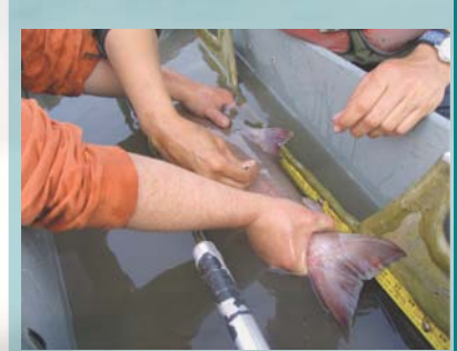
Working on a Sockeye

We are pleased to announce that based on the CVRF funded pilot study of 2005, the Arctic-Yukon Sustainable Salmon Initiative (AYKSSI) has provided $470,000 to conduct a two-year study which will begin this spring. This study will be implemented by the ADF&G Commercial Fisheries Division.