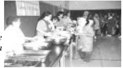
Quinhagak residents lining up to get their share of donation by CVRF's partners in Seattle

"Potlatch-atuurilriakut tang, Assirluni."