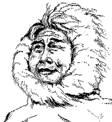
Photo not available