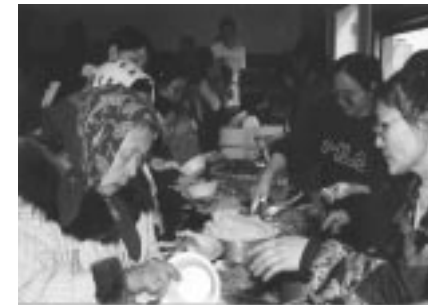
Hooper Bay guests enjoy CDQ Harvest Potlatch.

On Saturday, March 13, CVRF sponsored a potlatch in Hooper Bay. The timing of the potlatch could not have come at a better time as it coincided with the Louis Bunyan Bladder Festival potlatch. The potlatch was held in the high school gym. Approximately 300-400 people from the community and nearby villages came to feast on crab, pollock, and other fish which was provided by CVRF partner companies. Local dishes included the ever favorite akutaq, along with muktak, walrus skin, seal meat, oil bread, and other finger licking good homestyle entree's. A member of the community said that this potlatch was the best ever in terms of food and participation.