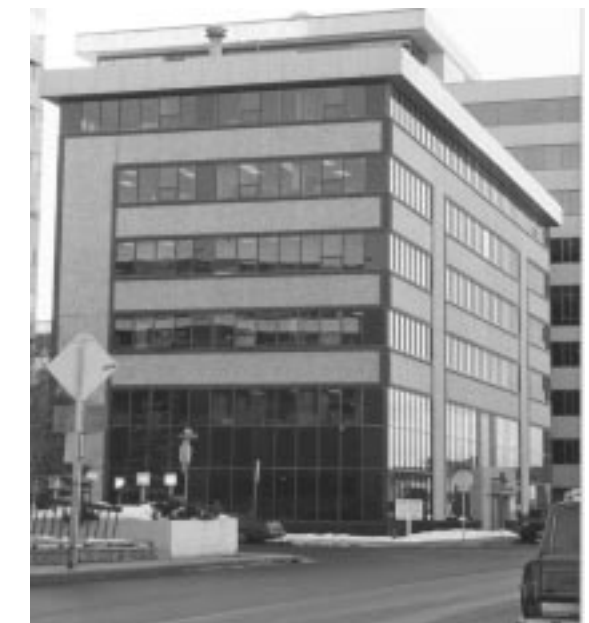
Coastal Villages Region Fund Anchorage office is located on the corner of 7th and H on the second floor of this building.