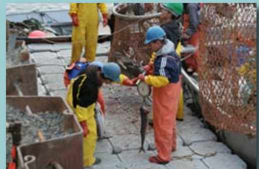
Working at the Quinhagak dock