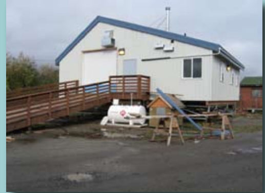
The Fritz Willie Memorial FSC in Napakiak is now operational as of this fall

As 2007 comes to a close we look forward to the New Year. CVRF remains committed to the stability and adaptability that is enhancing the lives of the people of the CVRF region.