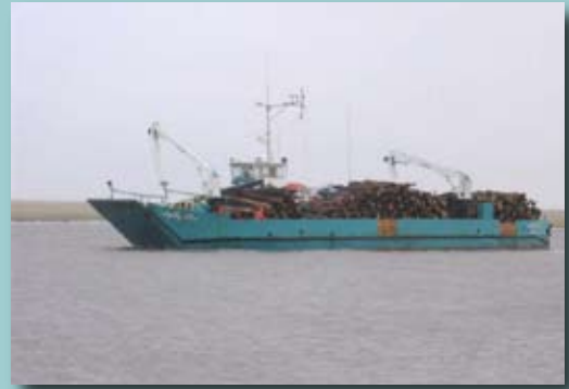
The Kelly Mae delivering wood to Scammon Bay

We wish everyone a warm and happy winter!