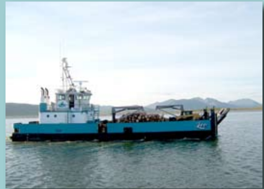
The Leo delivering wood to Goodnews Bay