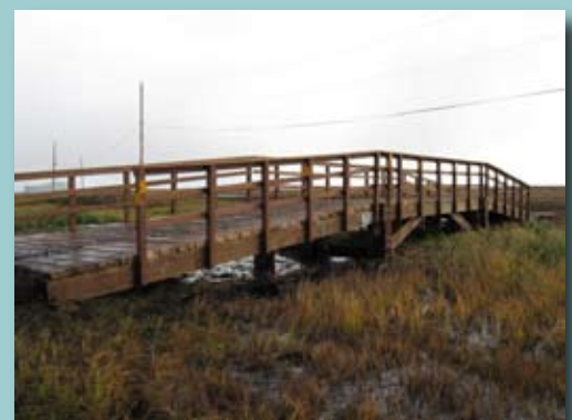
The Chefornak bridge to the FSC