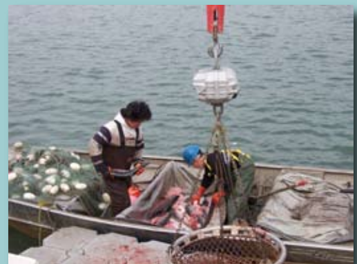
Delivering fresh-iced salmon to Quinhagak