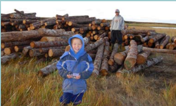
Picking up wood in Newtok