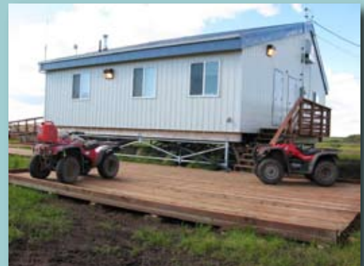
The Kongiganak FSC has a new boardwalk