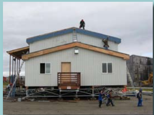
The Chevak FSC was completed this fall