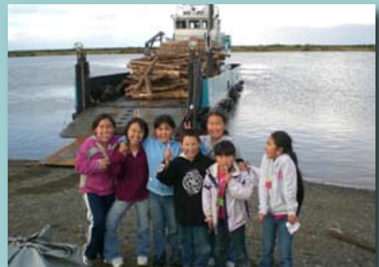
Delivering wood to Eek