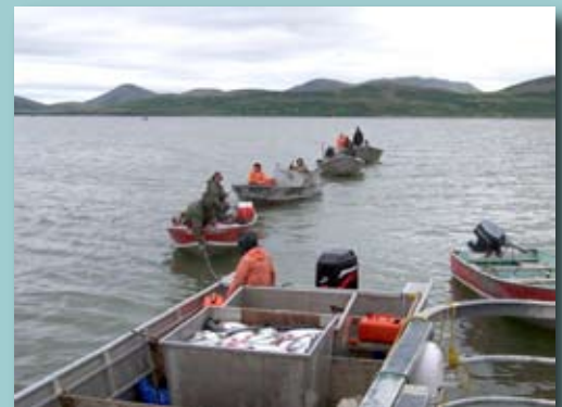
Fishermen delivering salmon to the Eider